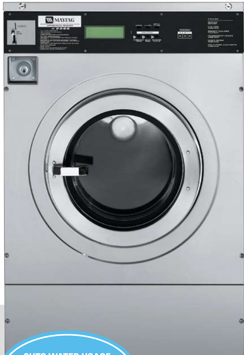
Model MFR40PD shown.

CUTS WATER USAGE BY UP TO 44% WITH THE TURBOWASH™ SYSTEM.*