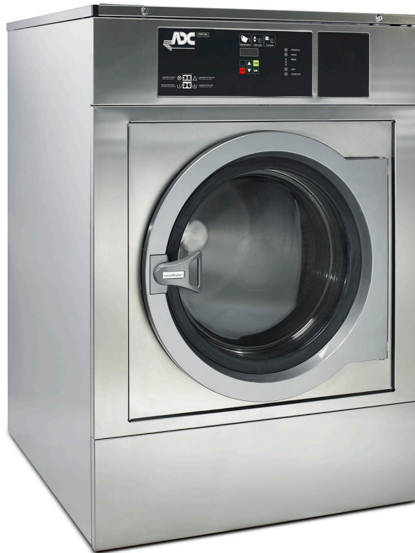
Shown with M2 Controller

EWS-25M2 EWS-30M2 EWS-40M2 EWS-60M2 EWS-80M2